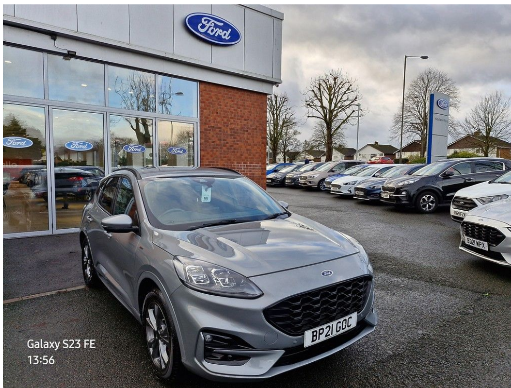
Galaxy S23 FE 13:56