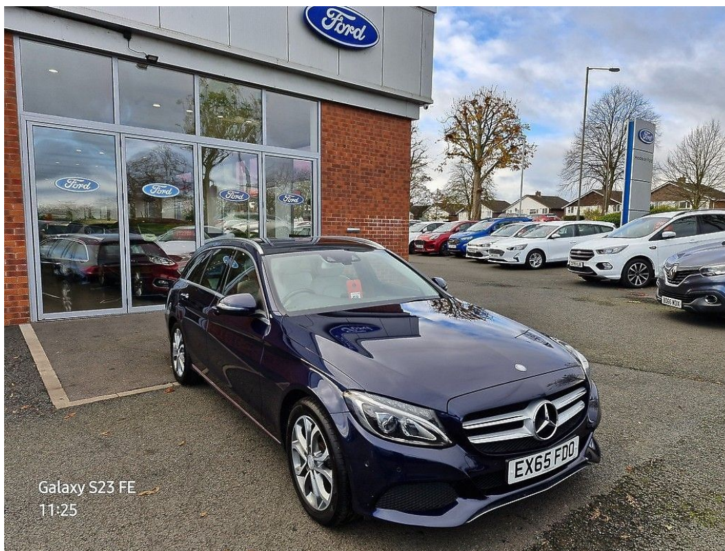
Galaxy S23 FE 11:25

Mercedes-Benz C Class 2.0 C200 Sport (Premium) Estate 5dr Petrol 7G-Tronic+ Euro 6 (s/s) (18)