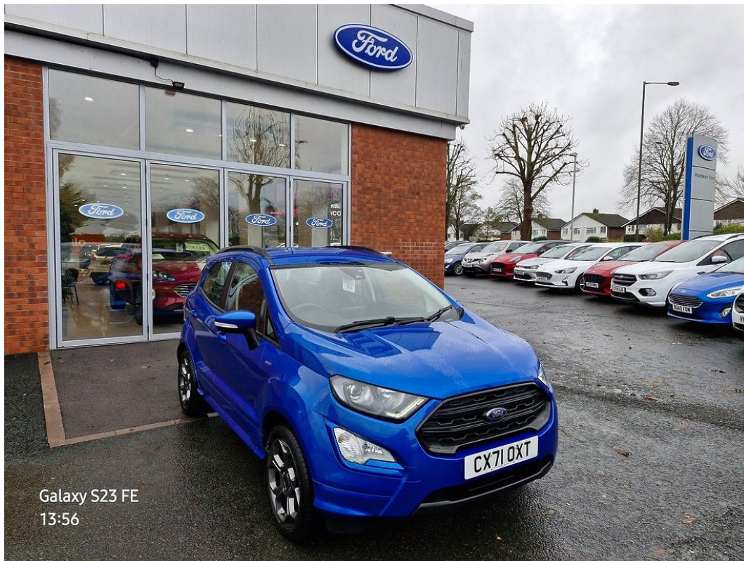
Galaxy S23 FE 13:56